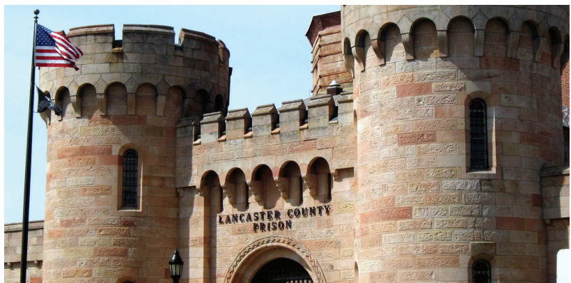
The Lancaster County Prison was originally built in 1737 then remodeled in 1851.

Instead of complying with the terms of the arbitration ruling, the county ended up wasting hundreds of thousands of taxpayer dollars in a drawn-out legal process. As an added result, it will also have to pay interest on top of the raises. ●