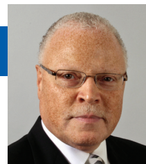
Lee Saunders President

• In 2012, GEO settled a lawsuit alleging that guards at the Walnut Grove Youth Correctional Facility in Mississippi smuggled drugs into the prison, had sex with inmates, and allowed fights between inmates that resulted in stabbings and severe beatings. The youths were also denied proper health care and access to basic education; most of them were serving time for nonviolent offenses and