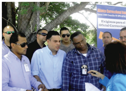
After years of struggle, ACU members achieved a big victory when Puerto Rico agreed to restore to them more than $35 million in unpaid overtime wages.