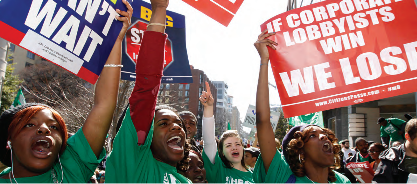
AFSCME members protest outsourcing at every step.