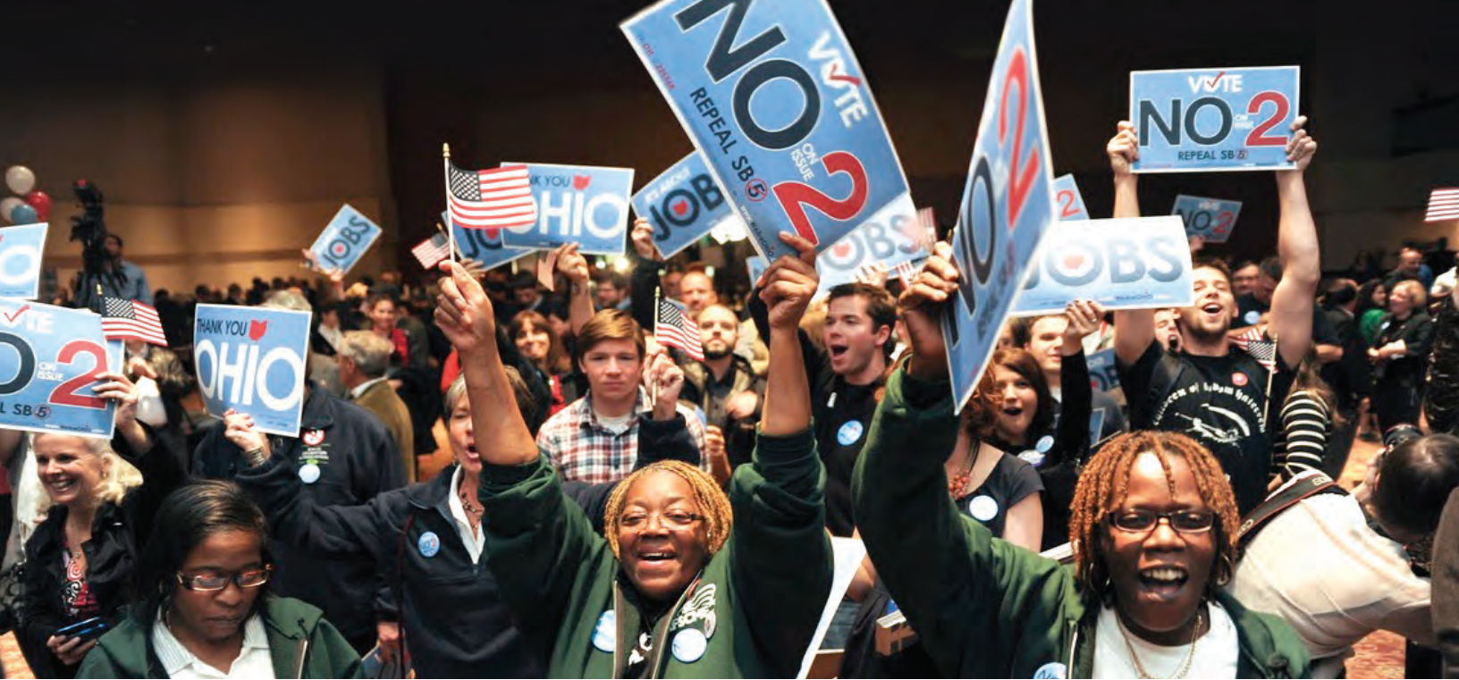
AFSCME members stood up for Ohio workers and helped repeal the anti-worker Senate Bill 5.